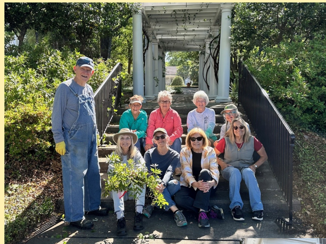
Group After Workday April 20, 2026

In April we planted black haw viburnum, redbud, winter jasmine, sweet shrub, tractor seat plant, French hydrangea, English dogwood, frost weed, marigold, basil, tomatoes, and others. We pulled weeds, laid pine-straw, trimmed branches, pruned shrubs, fertilized, and watered.