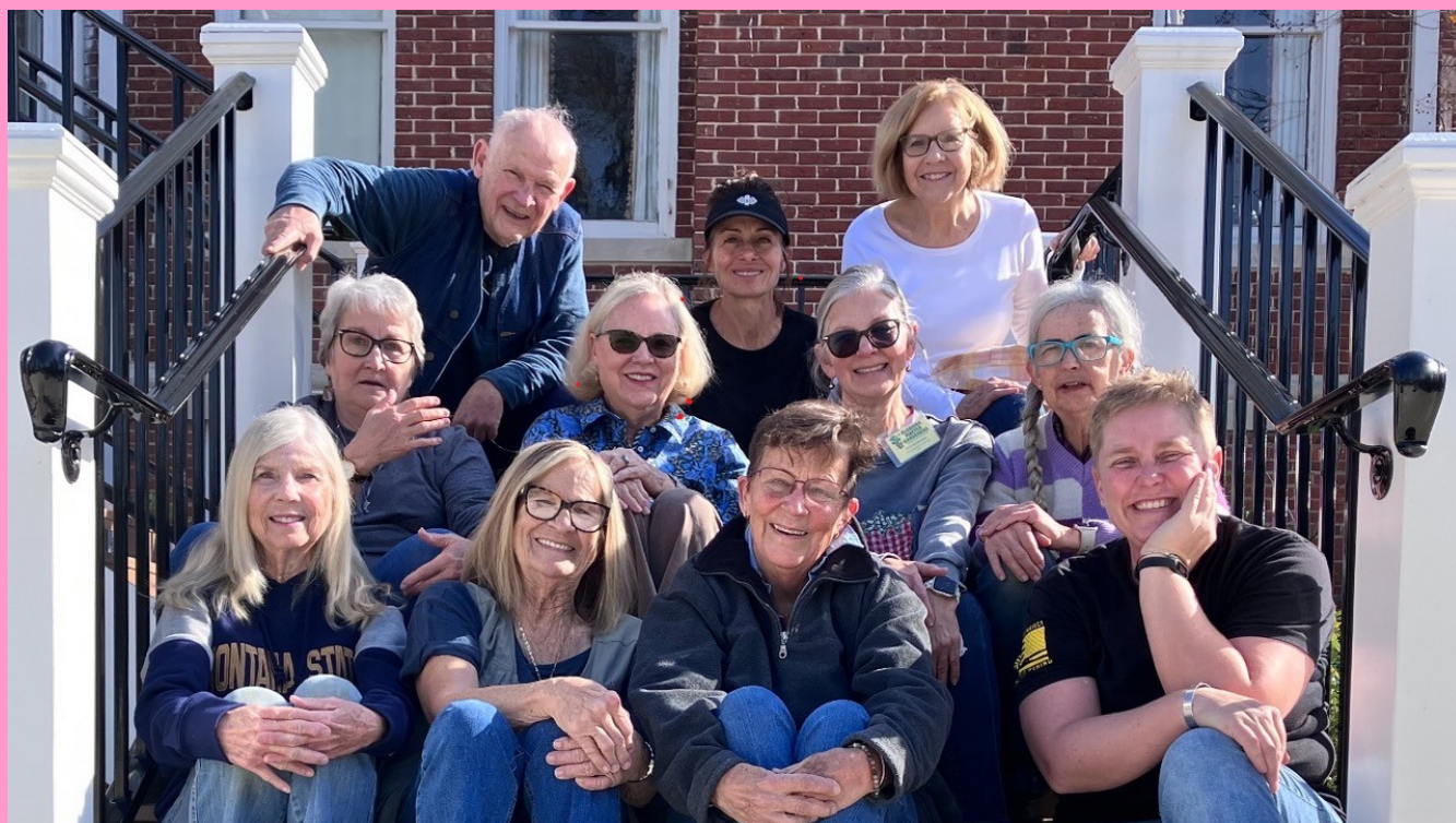
Group after last Hill House workday — January 2026

In January we cleaned up the Hill House from the Christmas tours and packed away the decorations. The only outdoor work during the month was the planting of three camellias. Other than that, it was too cold, so we had to cancel our work days.