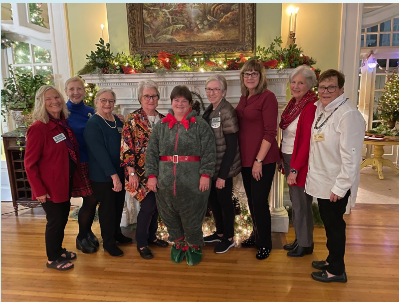
Candlelight tour of Hill House

In the Hill House, the Master Gardeners decorated, hosted, packed up, and cleaned up. Good time had by all.