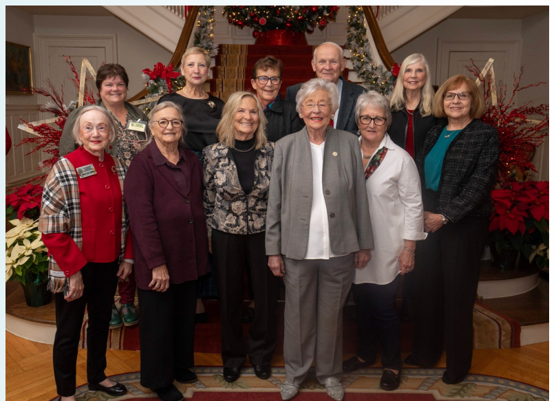
Photo with Governor Ivey