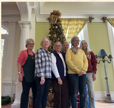
Group after workday November 25