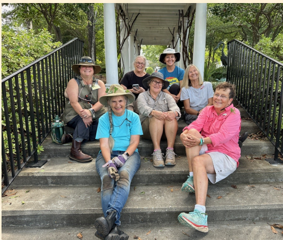
Group after work day 9-16-24