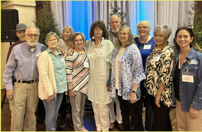
Alabama Master Gardener Association State Conference in Daphne, AL April 2024