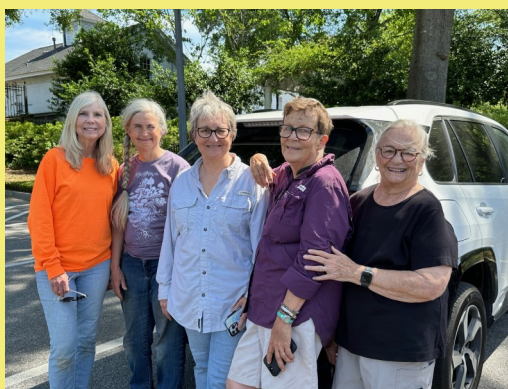
After workday April 29th