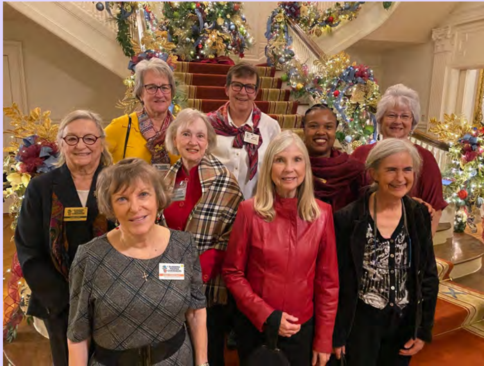
The volunteers are treated to an evening reception at the Mansion.