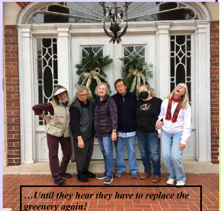
...Until they hear they have to replace the greenery again!