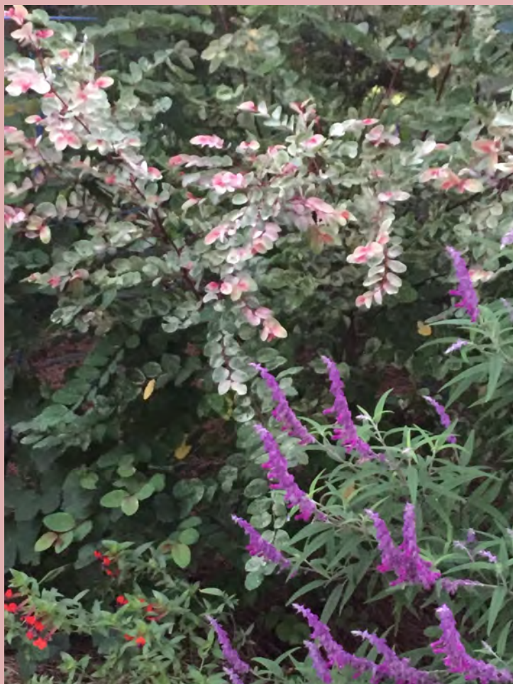
Rhona's Fall Garden